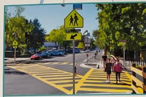
active transportation/traffic calming / transporte activo/calmar el tráfico