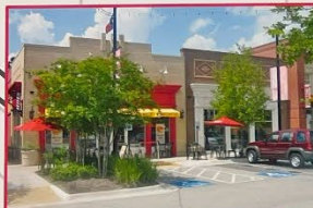
facade/streetscape improvements / mejoras en el paisaje urbano