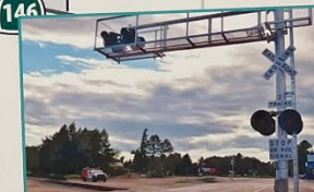
new railroad crossing 8th Street / nuevo cruce de ferrocarril calle 8th