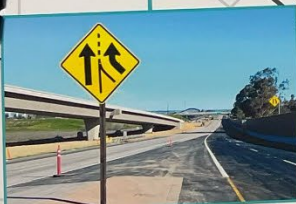
ramp improvements / mejoras en las rampas