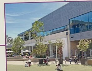
light Industrial R&D / parque tecnológico industrial