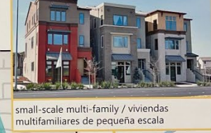
small-scale multi-family / viviendas multifamiliares de pequeña escala