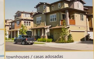
townhouses / casas adosadas