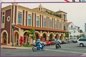
mixed use / uso mixto