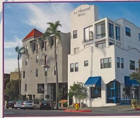
boutique hotel / hotel boutique