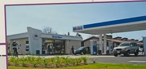
visitor serving uses / usos para visitantes