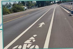
better access to Bryant Canyon Road / mejor acceso a Bryant Canyon Road