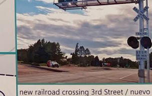
new railroad crossing 3rd Street / nuevo cruce de ferrocarril calle 3rd

Entry into shopping center, no bottlenecks