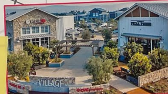
commercial center / centro comercial