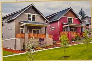
small single family homes / pequeñas viviendas unifamiliares