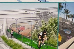
improved underpass / mejorar el paso subterráneo de carretera