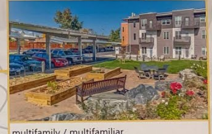
multifamily / multifamiliar