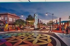
downtown gateway / entrada al centro